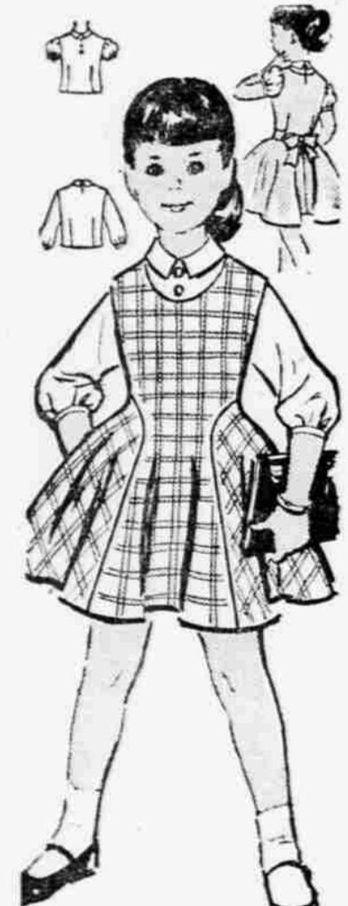
9261 SIZES 2-10 by Marian Martin

Her favorite school fashion—the jumped teamed with its own blouse or with other separates. Note the pretty princess lines, ideal for plaid or check. Easy sewing with our Printed Pattern. Printed Pattern 9261: Children's Sizes 2, 4, 6, 8, 10. Size 6 jumper takes 2 1/4 yards 39-inch blouse 1 yard.