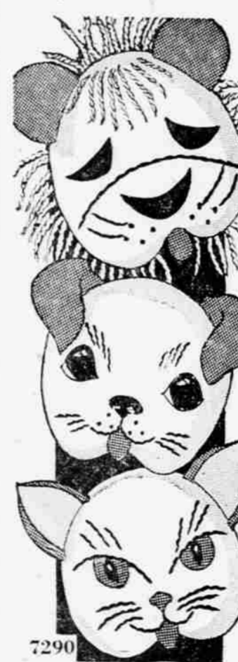
7290 by Alice Brooks

Brighten a youngster's room with these colorful pillows. Lion, dog, cat faces embroidered in natural colors—background of white or gray print. Pattern 7290: transfer of 3 faces, directions for pillows 10x10 inches. Ideal gift!