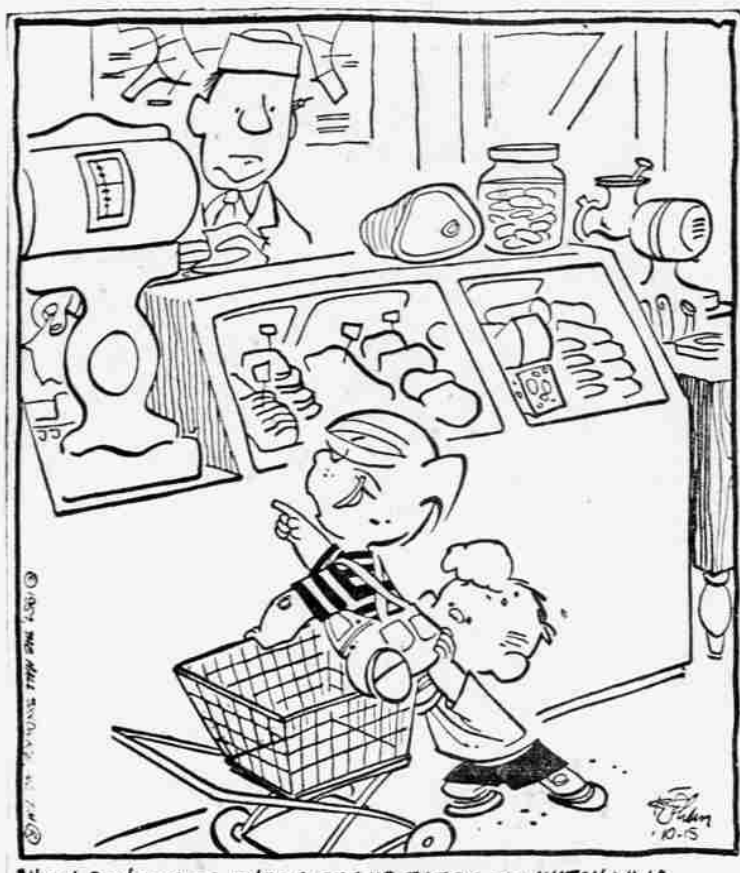
"HEY! DON'T WEIGH IT TIL I GET UP THERE TO WATCH YA!"