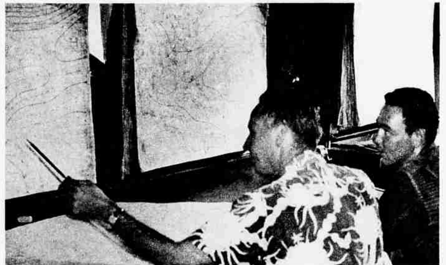
Weather experts study charts and maps in search for secret of storms.