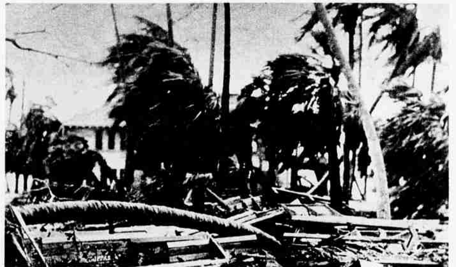
Unless secret is found, havoc of hurricanes will continue to plague coasts.