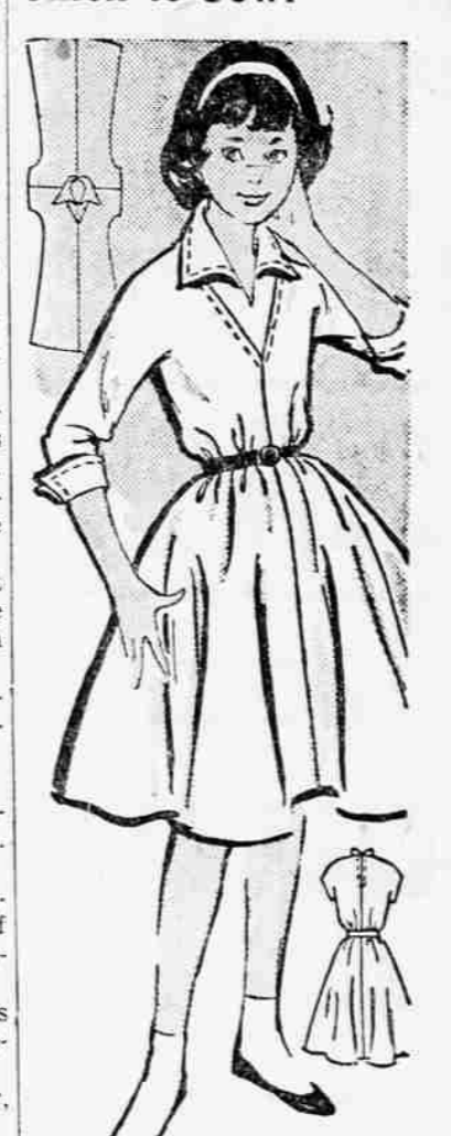
9227 SIZES 6-14