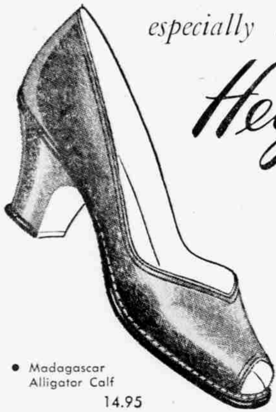
• Madagascar Alligator Calf 14.95

These smartly-styled, easy-wearing low and medium heels let you be attractive and active. For travel, shopping, parties ... these Heydays make every step a happy experience.