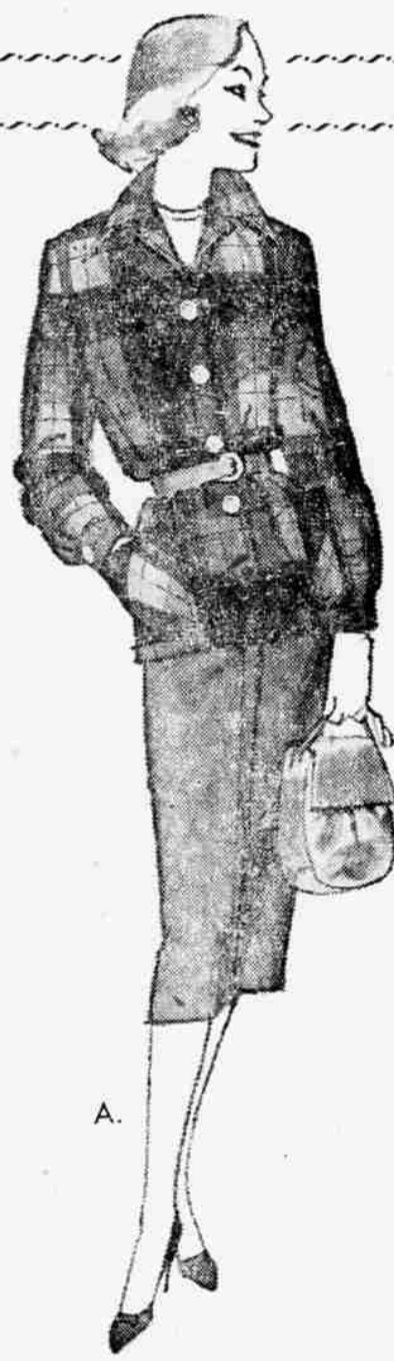
(A.) Pendleton Pairables

New, pure virgin wool Pendleton sportswear separates in perfectly coordinated colors. Pick yours now! 49'er, sizes 10-20 17.95 Skirts, 10-20 14.95 Sweaters from 8.95