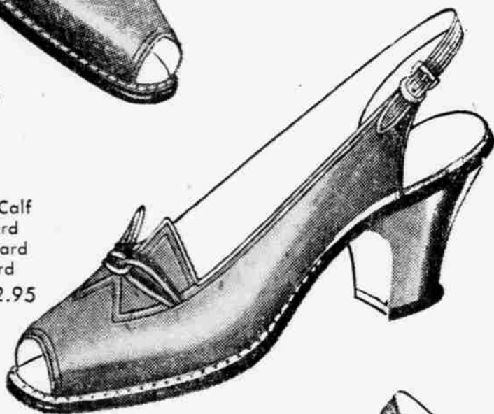
• Alligator Calf • Black Lizard • Brown Lizard • Grey Lizard 12.95