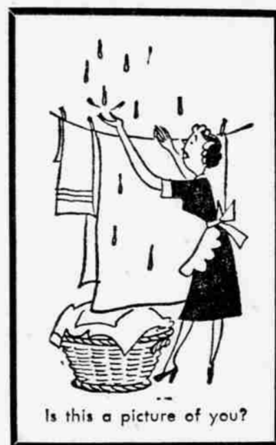
Is this a picture of you?