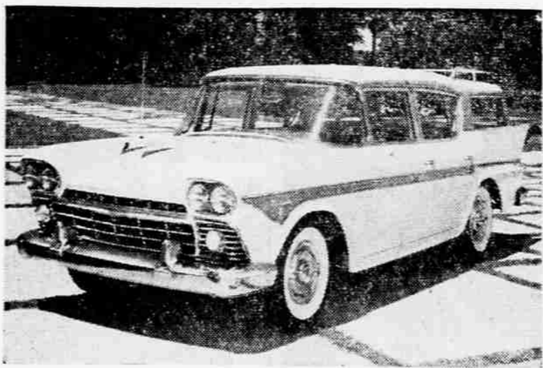
ON DISPLAY — The 1958 Rambler models will go on display Monday, Oct. 21, at Lea Motors, Fifth and Bartlett sts., Medford. The Cross Country station wagon, shown above, features the notched roof with chrome travel rack. Compactness and economy keynote the new Rambler line, which has major style changes inside and out.