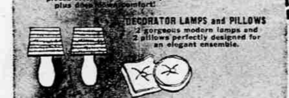
DECORATOR LAMPS AND PILLOWS 2 gorgeous modern lamps and 2 pillows perfectly designed for an elegant ensemble.