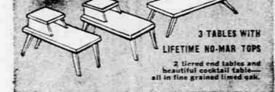
3 TABLES WITH LIFETIME NO-MAR TOPS 2 tiered end tables and beautiful cocktail table—all in fine grained lined oak.

Picture this handsome ensemble in your home, making your living room a showplace! Taken right from the pages of the decorator's book—right from the expensive custom order stylings, to bring you high fashion at a remarkable price. And BILTWELL workmanship is famous—designed to keep its beauty forever. See this new Day-nite STARLIGHTER group today . . . You'll want it in your home tomorrow!