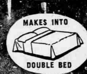
MAKES INTO DOUBLE BED