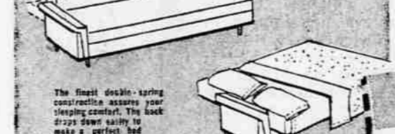
LONG SECTION IS BIG DOUBLE BED BY NITE