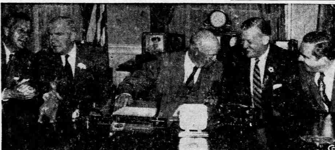
MEETING IN WHITE HOUSE, governors of southern states try to work out solution of school integration crisis. From left: Leroy Collins, Fla.; Luther Hodges, N. C.; President Eisenhower; Theodore McKeldin, Md., and Frank Clement, Tenn.

The final panel was devoted to a discussion of how United Press can improve its service.