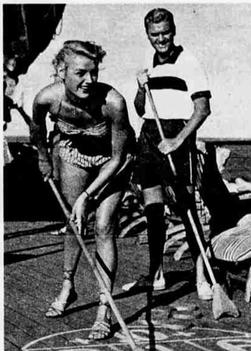
Shipboard fun, then new adventures in port.

If you're interested in buying foreign goods such as lace, leather, antiques, or photographic equipment, check to make sure your cruise will stop in a free port where prices are lowest.