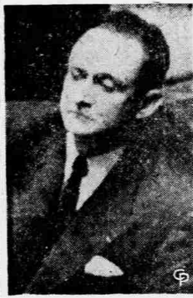
LOSING vote of confidence on Algerian issue, Premier Maurice Bourges-Manoury resigns as premier of France. (International)

Use Mail Tribune Want Ads The Community's Biggest "Marketplace"