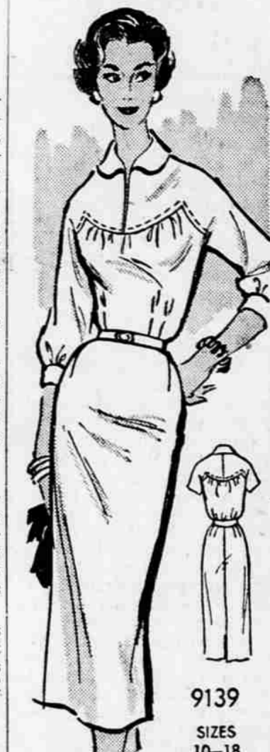
9139 SIZES 10-18 by Marianne Martin

The bloused back silhouette Paris loves! Be among the first with the newest look in fashion—make this sew-easy Printed Pattern now. Note the unusual yoke detail, puffed sleeves, contour belt—so smart!