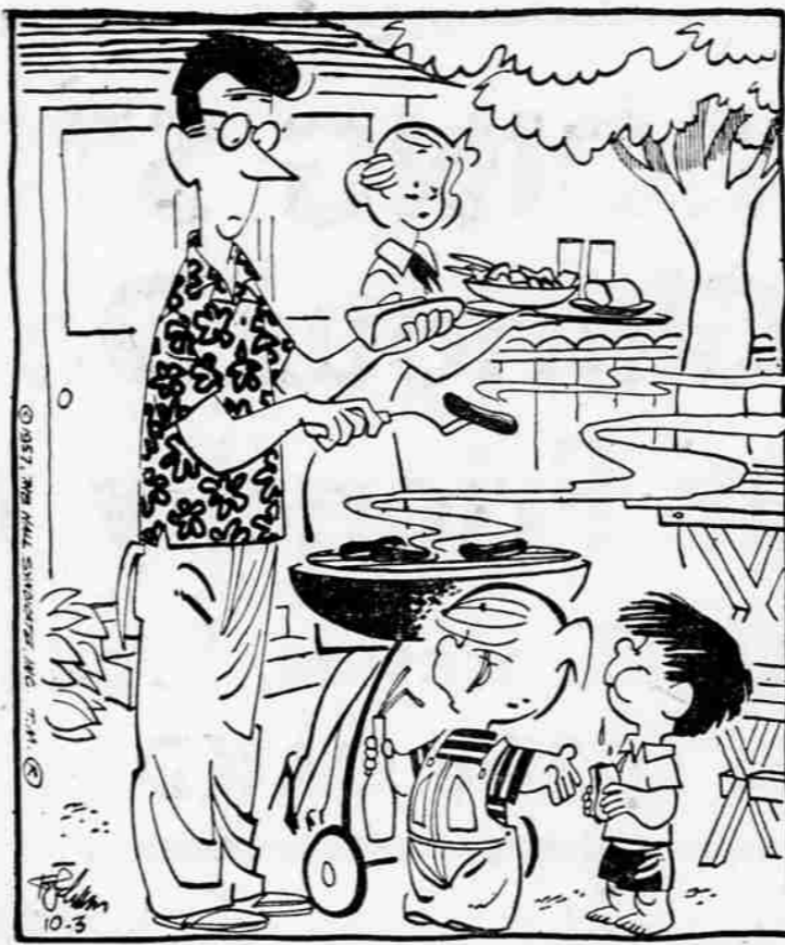
I'll tell ya why the poor kids eatin' so many hotdogs: his folks are VEGETARIANS!