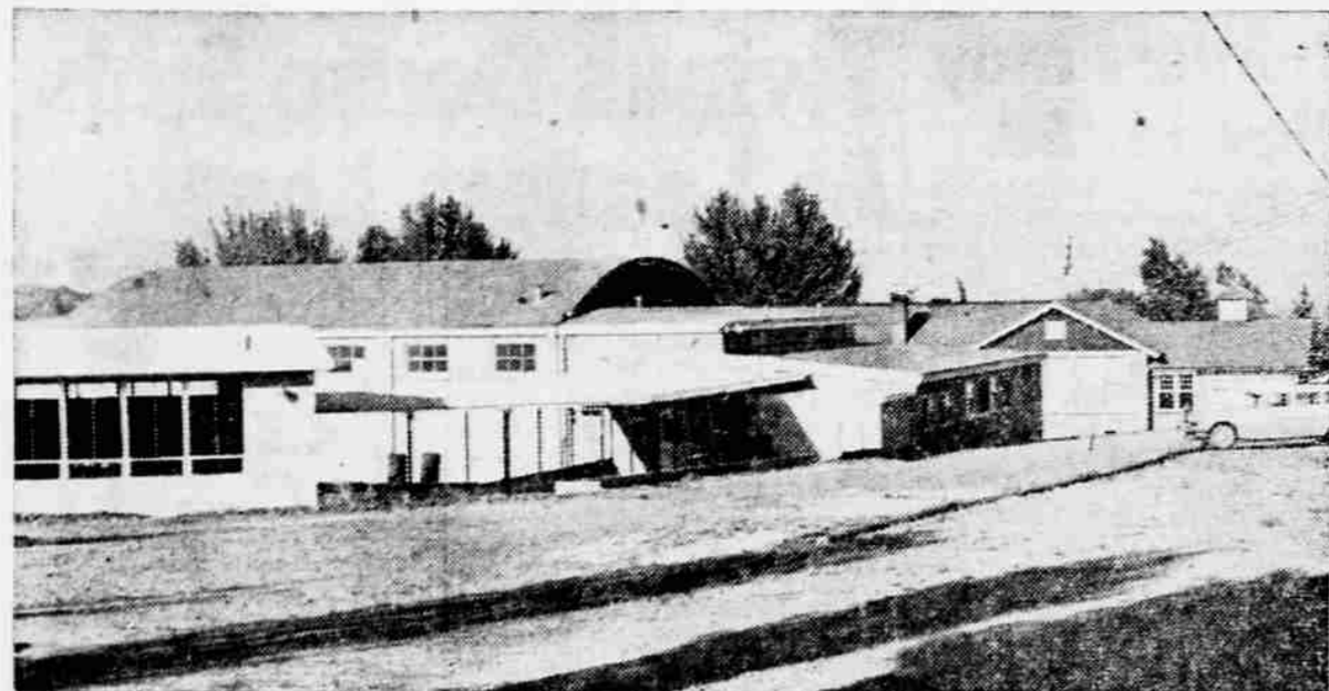
PRESENT SCHOOL —There is a great deal of difference between the Lone Pine school today and the tiny wooden structure that students attended when the district was first formed in 1857. Modern classrooms, a gymnasium, and a landscaped front yard make it one of southern Oregon's most attractive

schools. A barbecue dinner at the school tomorrow evening, sponsored by the Lone Pine PTA, is to celebrate the 100th anniversary of the district and raise money for construction of a new turf field south of the classrooms built last year. The school now has an enrollment of about 275 students.