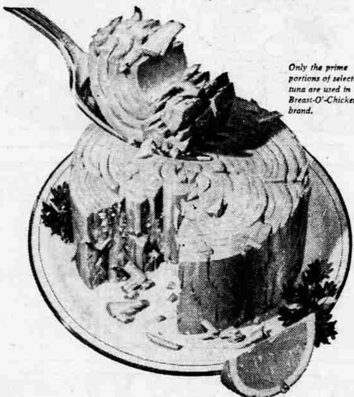
Only the prime portions of selected tuna are used in Breast-O'-Chicken brand.

PEPSI-COLA BOTTLING COMPANY, MEDFORD, OREGON