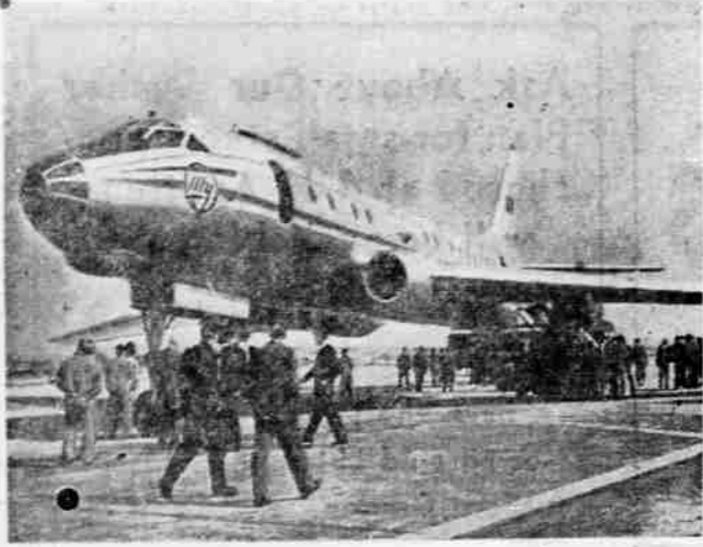
UNPRECEDENTED MOVE —The U. S., in an unprecedented move, approved a Soviet request to land two Russian TU-104 twin-jet airliners in New York early next month. The jets, one of which is shown above at a Paris, France airport last May, will bring members of the Soviet delegation to the United Nations from Moscow.