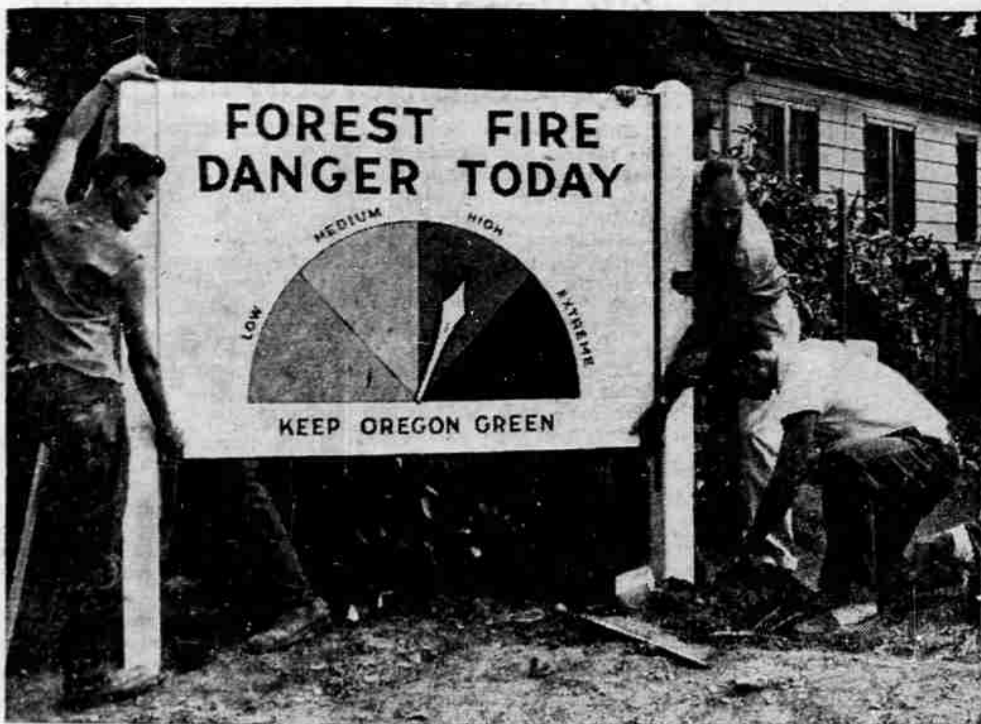
NEW SIGN—A colorful new sign board with a moveable pointer to indicate the day-to-day forest fire danger in this area...