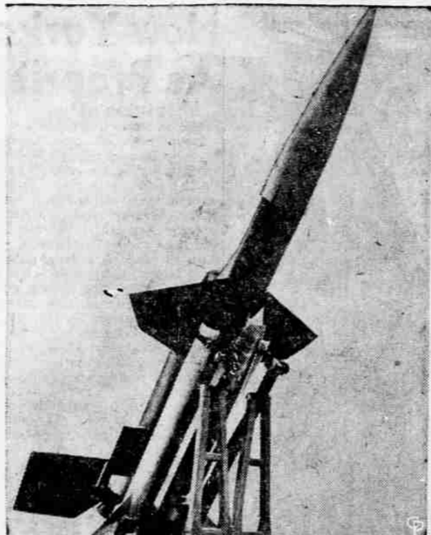
UNCANNY ACCURACY IS CLAIMED for latest British missile, shown here on launcher at Bristol, England. The "Bloodhound," powered by two Thor-type ram-jet engines, is in production now.

Friday afternoon will see the start of the two day rodeo and the top cowboys in the Northwest will be competing for rodeo purse of $1250.