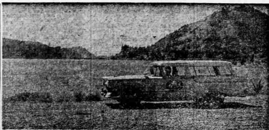
There are four developed Lane county parks along the shores of the lake behind Dorena dam. Here, the Oregon State Motor association car stops at Harms park, which has boat moorage and an excellent launching ramp. The Dorena dam in the center background.

The public meeting took action to recommend that the county commission set up an