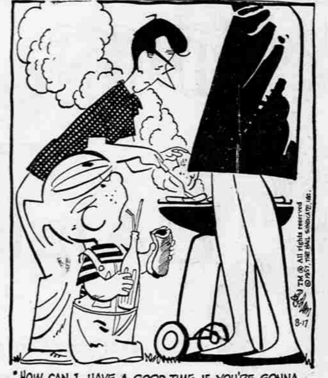
"How can I have a good time if you're gonna count my hot dogs?"

LOBBYISTS representing Japan and Germany for example—one of them retained, according to "Congressional Quarterly" on a contingent fee of