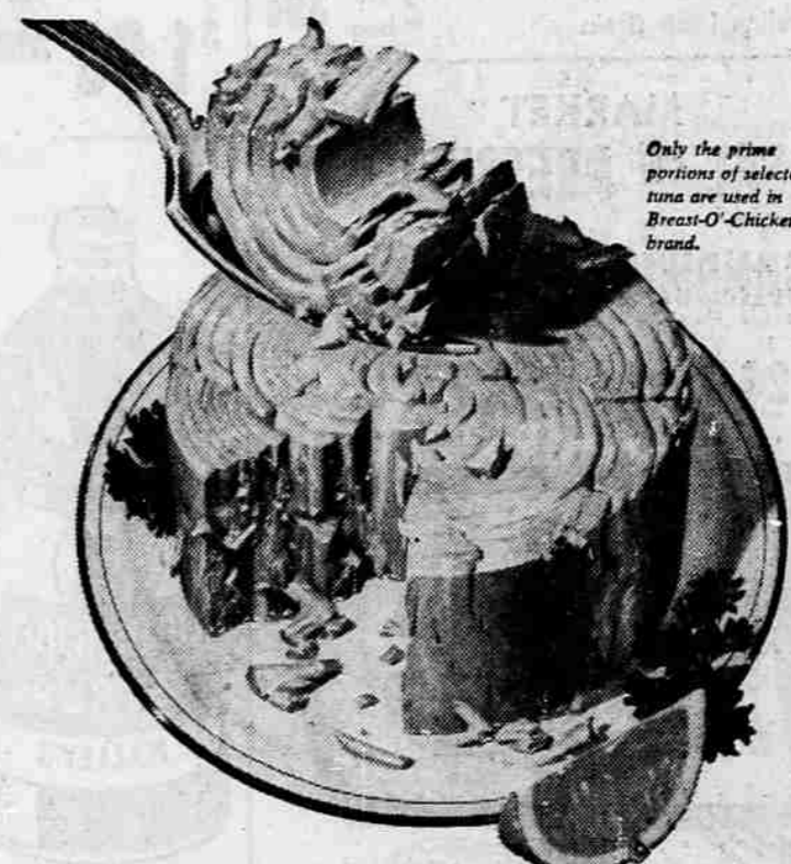
Only the prime portions of selected tuna are used in Breast-O'-Chicken brand.

A bonus for our readers: two FREE patterns, printed in our new Alice Brooks Needlecraft Book for 1957! Plus a variety of designs to order — crochet, knitting, embroidery, huck weaving, toys, dolls, others. Send 25 cents for your copy of this needlecraft book — now!