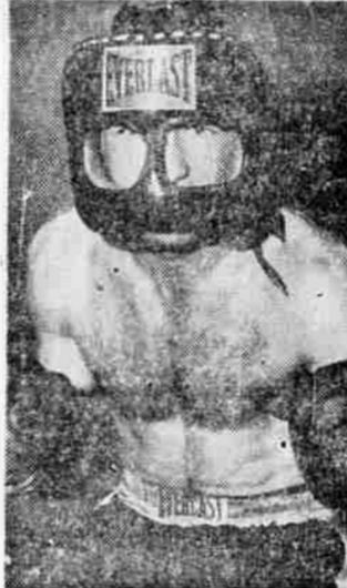
BOO!—If he wore that thing into the ring against middleweight champ Sugar Ray Robinson, welterweight champ Carmen Basilio might win on a scare alone. Basilio, the man behind the mask, is in training at Alexandria Bay, N. Y. for his middleweight title fight with Robinson. Basilio might be following in Ray's footsteps as Ray once held the welterweight crown.

Golfing members of RVCC who are not playing in the Southern Oregon have been requested to have their lockers empty by Aug. 24 in order that they can be used by visiting contestants.