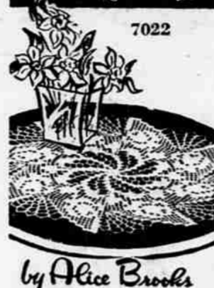
An unusual combination of filet and regular crochet gives a beautiful, different effect to this rose centerpiece. A fascinating design to crochet.

Pattern 7022, crochet directions for 19-inch doll in No. 30 cotton; larger in string.