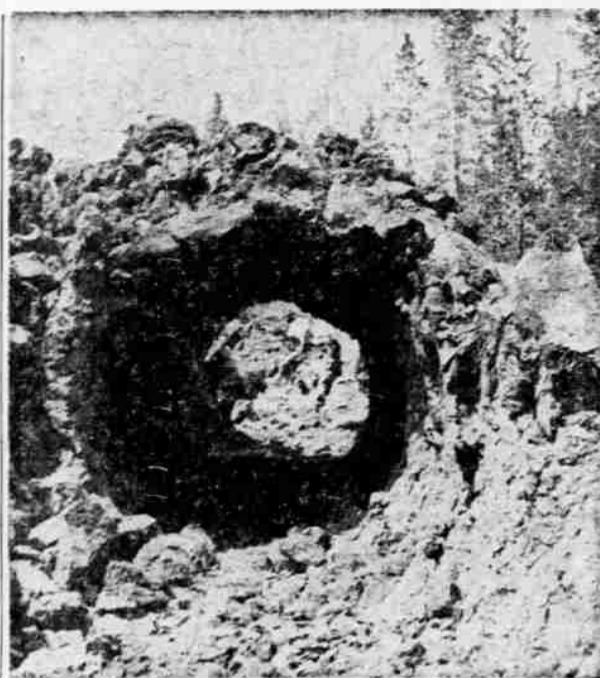
Tunnels formed ages ago rest in lava beds of Central Oregon. Melted lava buried trees. Wood burned away, leaving tunnel.

We chose to visit Lava Casts forest. A left turn was made off 97 a short distance south of Lava River Caves state park. The forest lies some ten miles in from the highway. No one should attempt this one-way road unless driving a dust-proof tank. Powdered soil filtered into the station wagon, covering the food box, clothing and baggage. It sifted into our throats, ears, and turned our hair a premature gray. The dusty trail threads