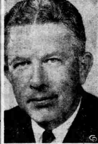
CALLING AT White House, Neil H. McElroy, Procter & Gamble Co. president, is mentioned as possible successor to Defense Secretary Charles E. Wilson, who plans an early retirement.