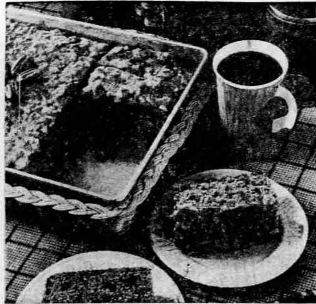
CAKE ON PICNIC —Take it easy. Bake a cake and take it along right in the pan in which it is baked. Treat your picnickers to the new instant chocolate chip cake or the instant lemon flake cake; both made with "mixes." Or bake one of each and top with frostings suggested in today's food columns.

Peach Preserves Capture nature's full fresh peach flavor in glass. We suggest putting some of your peach preserves in jelly glasses; then every last bite will be eaten when served with no storage holdovers. From each two pounds of ripe peaches you'll get about four cups sliced peach-