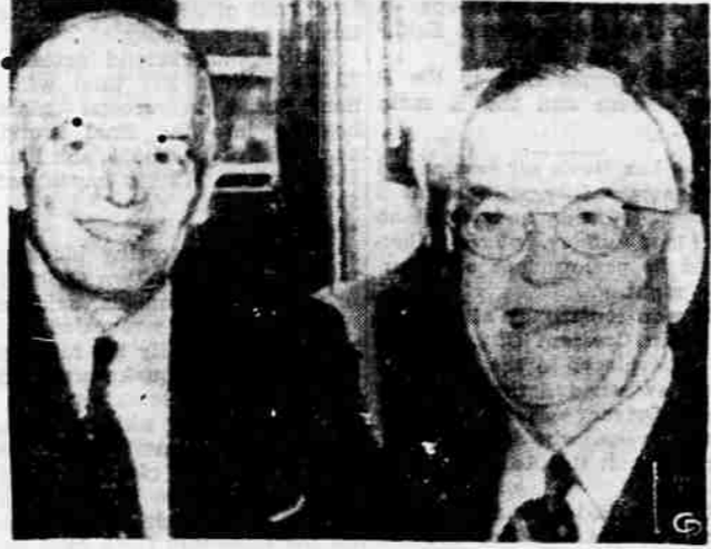
HOPING FOR AGREEMENT on disarmament program, Secretary of State Dulles (right) and Harold Stassen confer in London on program to be offered to Russia.

Taking the whole effort of the designing boys—with special emphasis on the hat creations—and trying to find an overall title for their 1957 work, let's give it a name it's begging for: The clown look.