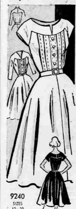
9240 SIZES 12-20 by Marian Martin

The "sissy" front dress—spans the seasons so beautifully, in almost any fabric! Two necklines, two sleeve versions in our Printed Pattern make it ideal all year. Tucked bodice, flaring skirt—easy to sew!