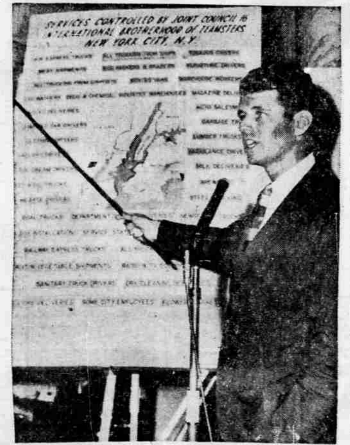
TEAMSTERS SERIOUS THREAT, IS CHARGE—The Senate labor rackets committee charged in Washington that the Teamsters Union is linked with plundering racketeers in New York and other major cities, posing a serious threat to the entire country.