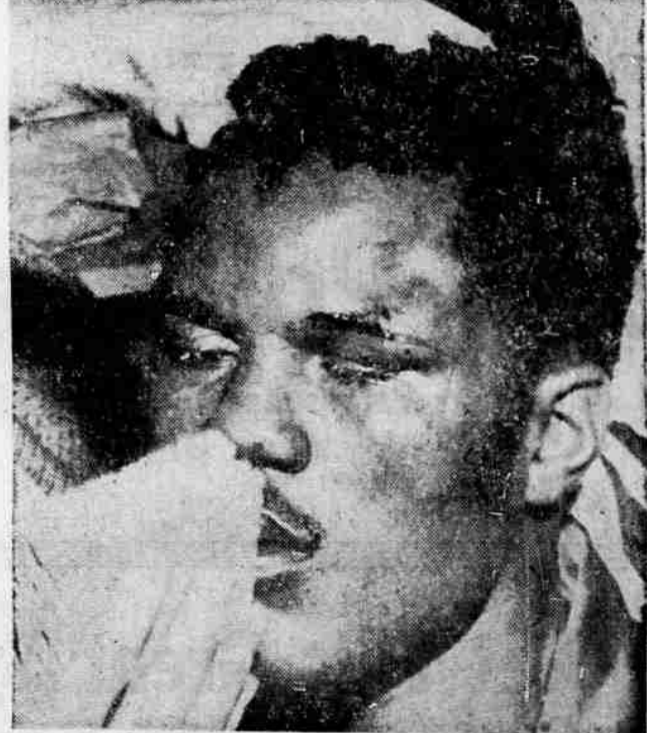
HEAVYWEIGHT CHALLENGER HOSPITALIZED — Tommy (Hurricane) Jackson is shown being treated in his dressing room in New York after losing by a TKO to champion Floyd Patterson at the Polo Grounds in the 10th round. Jackson was taken to the hospital where attendants reported his condition as "fair."