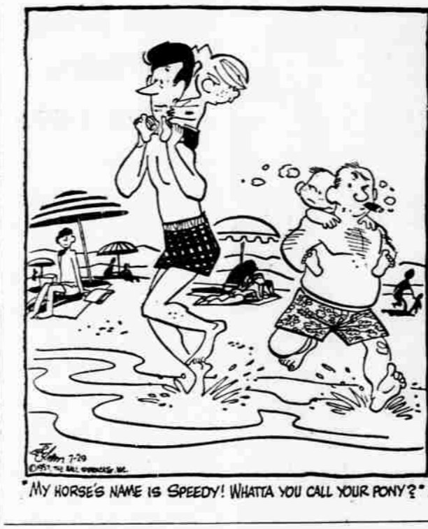
My horse's name is Speedy! Whatta you call your pony?

The Smoke Jumpers love their work. Many are college students, who spend their summer vacations in this manner. Some of the jumps they make, to the layman, seem incredibly hazardous. Yet, we were informed, there never has been a fatality