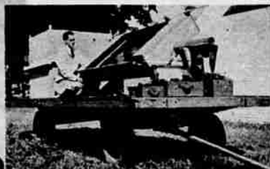
Promising experiment, using sun's rays to heat grain, may be replacement for heaters.