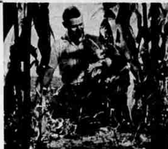
Sturdy dwarf corn, grown close to ground, is one of many new experimental crop varieties.

vested $13 billion. Until we can reduce such losses, scientific crop control might as well be done by flipping a coin.