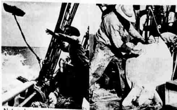
Nets only ensnare the monsters —bare hands must finish job.

THERE'S MORE to turtle soup than putting it in cans. Nicaraguan natives hunt the dangerous raw material off the coast of Central America with the most primitive of weapons—nets and bare hands. It's a perilous business—the turtles weigh up to 400 pounds—but a lucra- tive one, because the tasty turtle meat is becoming almost as popular as the soup; so much so that the constant deep-sea hunting has deci- mated the species. Some govern- ments now have laws limiting the hunting season, others eliminating it altogether to allow the giants in armor to rebuild their numbers.