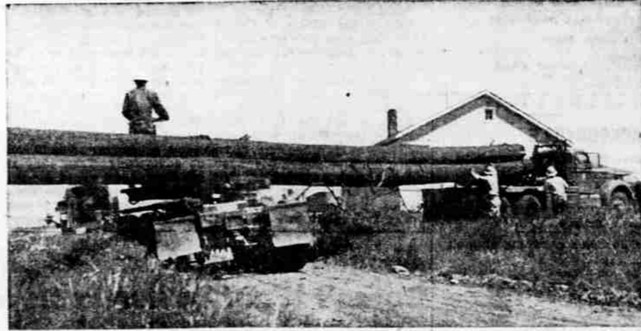
POLE TRANSPORT —A truck and trailer, which has a steering device, carry power poles to the point where they will be raised and set in the ground. The poles support three

Augusta, Me.—Maine has raised its fee for automobile operators' licenses for the first time since 1912. This year's legislature hiked the fee from $2 to $3.