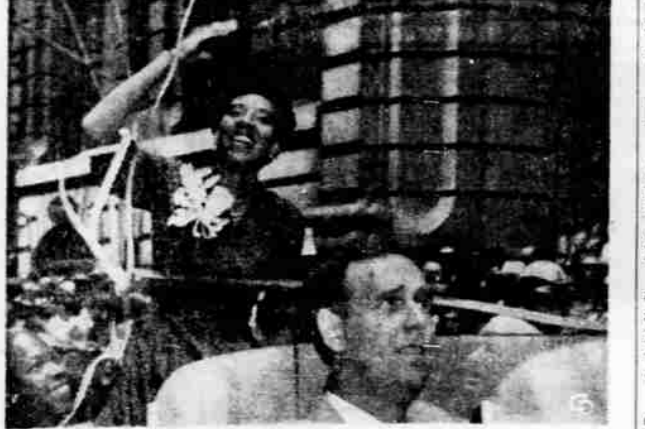
RADIANT IN THE FLUSH OF VICTORY, Althea Gibson, first Negro woman to ever win a Wimbledon tennis championship, is feted in a parade up Broadway in New York. It was the nation's official tribute.

St. Peter's Lutheran followed by winning a forfeit from Phoenix Presbyterians.