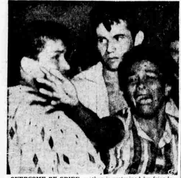
OVERCOME BY GRIEF , mother is restrained by friends after her daughter fell from tenement window in New York. Child is in critical condition. (International)