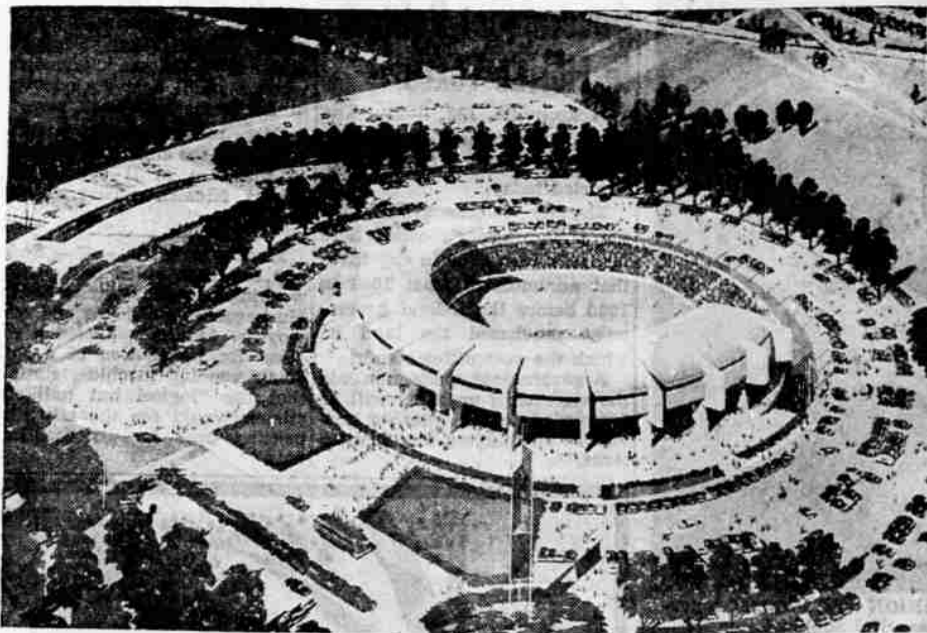
PROPOSED HOME FOR GIANTS—A building contractor has urged the city council of Hayward, Calif., to join it in seeking to persuade the New York Giants to transfer their baseball franchise to this city on the east shore of San Francisco Bay. Shown above is an artist's conception of the 90,000-seat all-purpose stadium which Braden Enterprises proposes to build if the Giants move to Hayward. Preliminary cost estimate of the stadium, parking facilities and an adjoining motel (left) is $8,370,000.

WATCH THOSE TREES Roselle, N.J. — An ordinance currently being considered by the city would require that a tree surgeon be in attendance during any digging that might damage the roots of a shade tree.