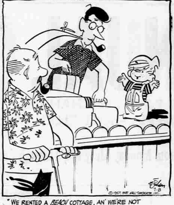
WE RENTED A BEACH COTTAGE, AN' WE'RE NOT GONNA SHAVE FOR A WHOLE WEEK!

It is up to all of us to see that this trend continues. We can do so by supporting better highways, better traffic controls, improved licensing and reexamination procedures, better safety devices. But the most important thing of all is to be careful and responsible, ourselves, when on the highways.—E.A.