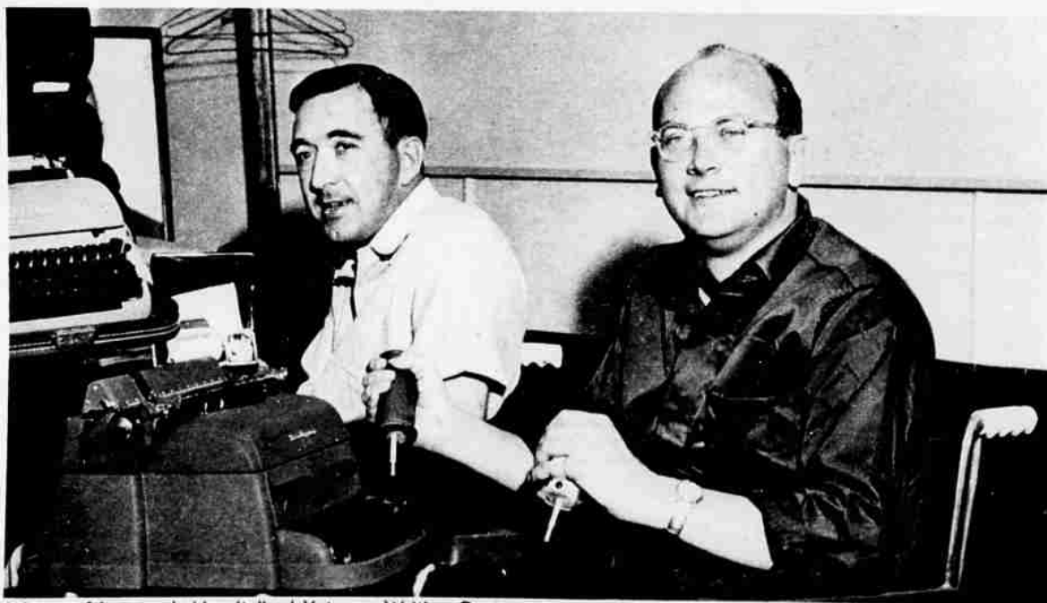
Winner of last year's Hospitalized Veterans Writing Contest was paraplegic vet (right) who devised his own typing tool.

Result? An article, "Rehabilitation Through Writing," which won him first place in last year's contest and the satisfaction that he had contributed something to his fellow veterans and to the world.