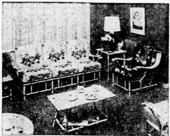
The furniture in this attractive room setting will live equally well outdoors in a patio or on a porch during the summer months. Yet it is attractive enough to be featured prominently indoors as well. The arms and frames of the seating pieces are made of solid ash; table tops are made of solid birch. It is available in a clear-tone, natural waxed lacquer finish. (Heywood-Wakefield Co.)