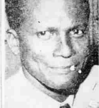
OUSTED by military junta, Daniel Fignole, Haiti's provisional president, arrives in Miami.