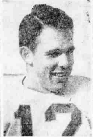
HONEYMOONING in Las Vegas, John Brodie, Stanford's All-American quarterback, denies cheating during examinations, which prevented his graduation last Sunday.