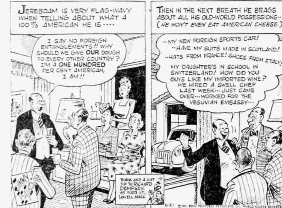
By Jimmy Hatlo