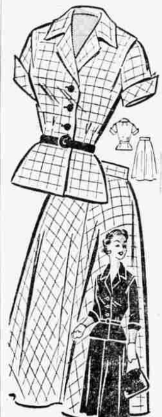
9328 14 1/2-26 1/2 Printed Pattern

Printed Pattern in Half Sizes! If you're the shorter, fuller figure, you know how slimming this two-piece dress will be! Classic lines adapt to many fabrics — look lovely on any occasion.