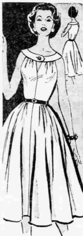
9087 SIZES 10-18 by Marianne Martin

Figure-flattery assured, by this lovely summer dress! It's simple, soft lines are ideal for the feminine look of sheer nylon, voiles; the elegance of dressy silks. Make it quickly, easily with our PRINTED PATTERN! Printed Pattern 9087: Misses' sizes 10, 12, 14, 16, 18. Size 16 requires 4 1/2 yards 35-inch fabric.