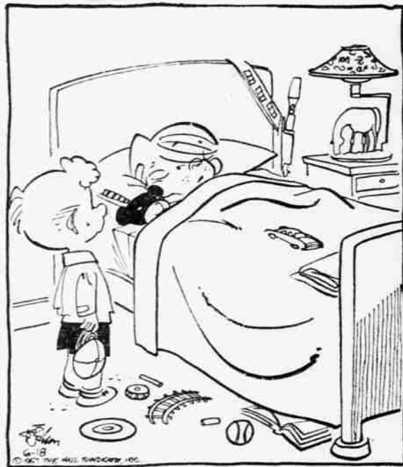
THEY WON'T LET ME HAVE ANY ROOT BEER. THAT'S WHY I'M SO WEAK.

But Supreme Court decisions of 1873, 1876, and 1883 invalidated much of this civil rights legislation. Despite the 14th and 15th Amendments the bulk of personal liberties was held to derive from state, not federal, citizenship. And most of what the Court had left of the legislation was repealed by Congress in 1894 and 1909.—E.R.R.