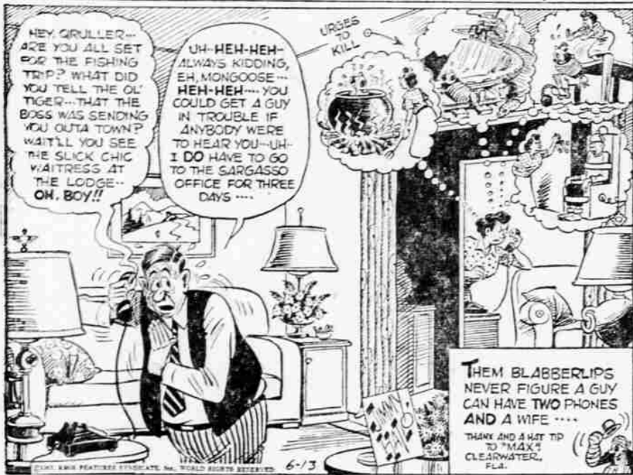
THEM BLABBERLIPS NEVER FIGURE A GUY CAN HAVE TWO PHONES AND A WIFE...