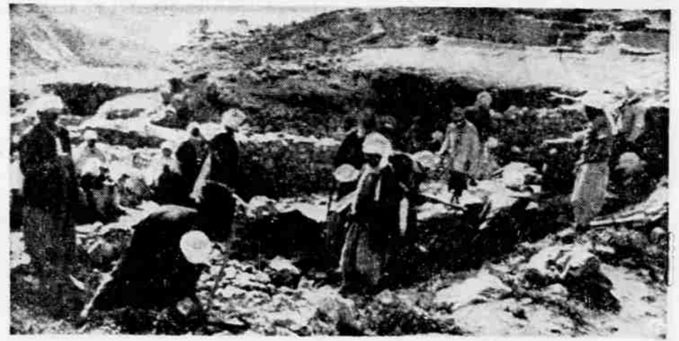
DIGGING IN ROCKY SOIL, people of neighboring villages help in burial of more than 300 men killed in Melouza by band of Moslem rebels.