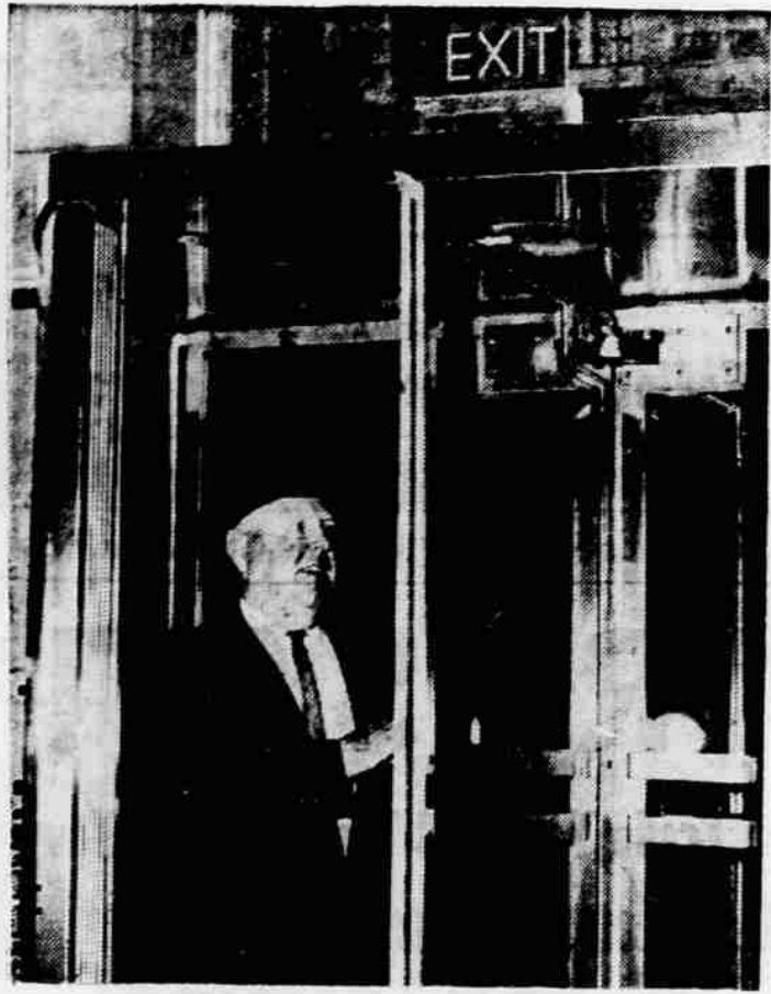
AFL-CIO HIGH COMMAND OUSTS BECK — Teamster Union Pres. Dave Beck passes under an exit sign as he arrives at the Washington headquarters of the AFL-CIO executive council for trial on charges of "bringing the labor movement into disrepute." The council found him "guilty as charged" by diverting Teamsters' dues into his own pockets and ousted him as an AFL-CIO vice president and executive council member.