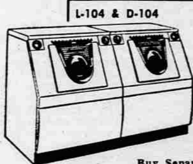
Buy Separately or Get the Pair & SAVE $40

Here's Special Low Prices on the WESTINGHOUSE LAUNDRY TWINS