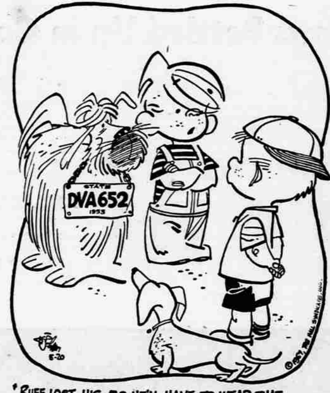
RUFF LOST HIS, SO HE'LL HAVE TO WEAR THAT 'TIL WE CAN BUY A DOG ONE.

Republican Central Committee Slates Meet The Jackson County Republican Central committee will meet at 8 p.m. Monday, May 27, in the Medford High school cafeteria.