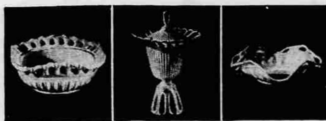
Square Nappy Complete & Cover 9-inch Square Bowl