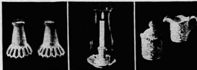
Pepper Mill & Salt Shaker Hurricane Lamp Cream & Sugar

What could be more perfect for giving — or for your own home — than lovely Fostoria Milk Glass! And because this is Fostoria Milk Glass you know it's authentic — handcrafted like priceless Early American milk glass. See our display of Fostoria Milk Glass, today.