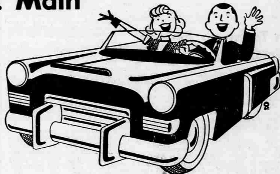
No employees of Mail Tribune or Eastside Market are eligible for giveaway.

A License Starting or Ending With the Following Numbers?