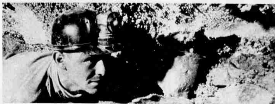
Claustrophobia—and a large waistline—have no place in caves. Passages sometimes narrow to crawl space, then open on a cathedral-like cavern never before seen.

ASK A SPELUNKER why he loves to explore caves, and his answer probably will be, "Because they're there."