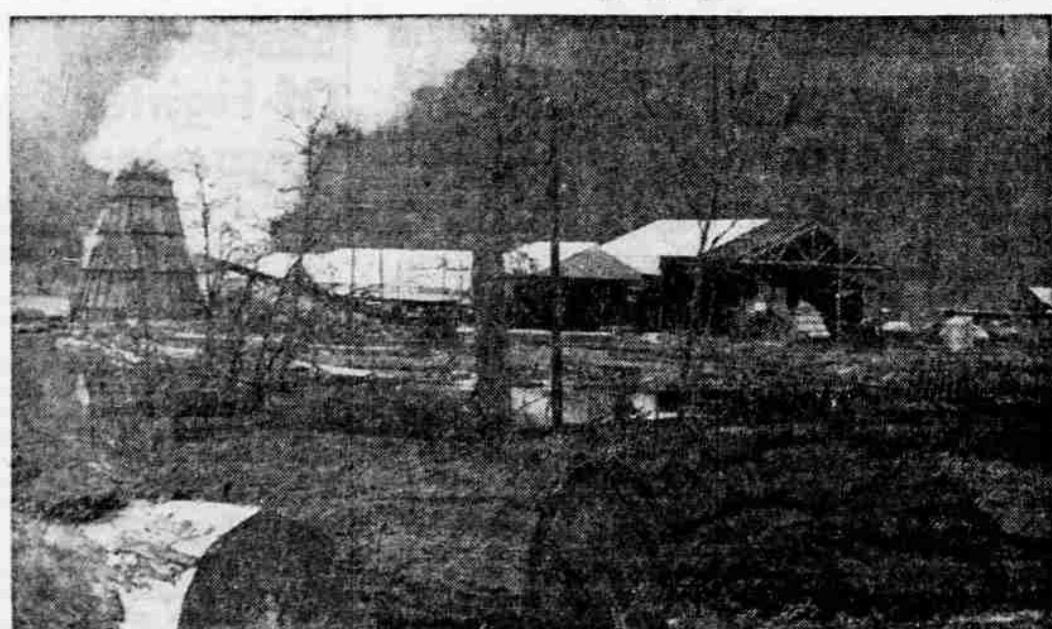
LUMBER INDUSTRY STRONG —An estimated 90 per cent of the population at Happy Camp are employed in the lumber industry. There are about eight major mills, including Yreka Veneer (shown above) which is located at the east approach to Happy Camp. Mining is next in line as a source of employment. Mining once was the backbone of the area's economy.

Get Pipe Line The county negotiated with the Federal Civil Defense agency to obtain about 8000 feet of aluminum pipe line with which to